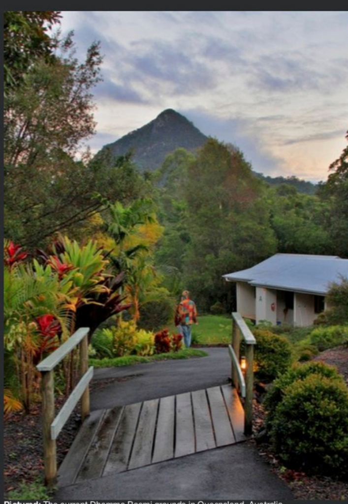
Pictured: The current Dhamma Rasmi grounds in Queensland, Australia.