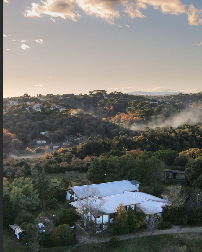
Pictured: Surrounding area of Dhamma Neru in Spain.