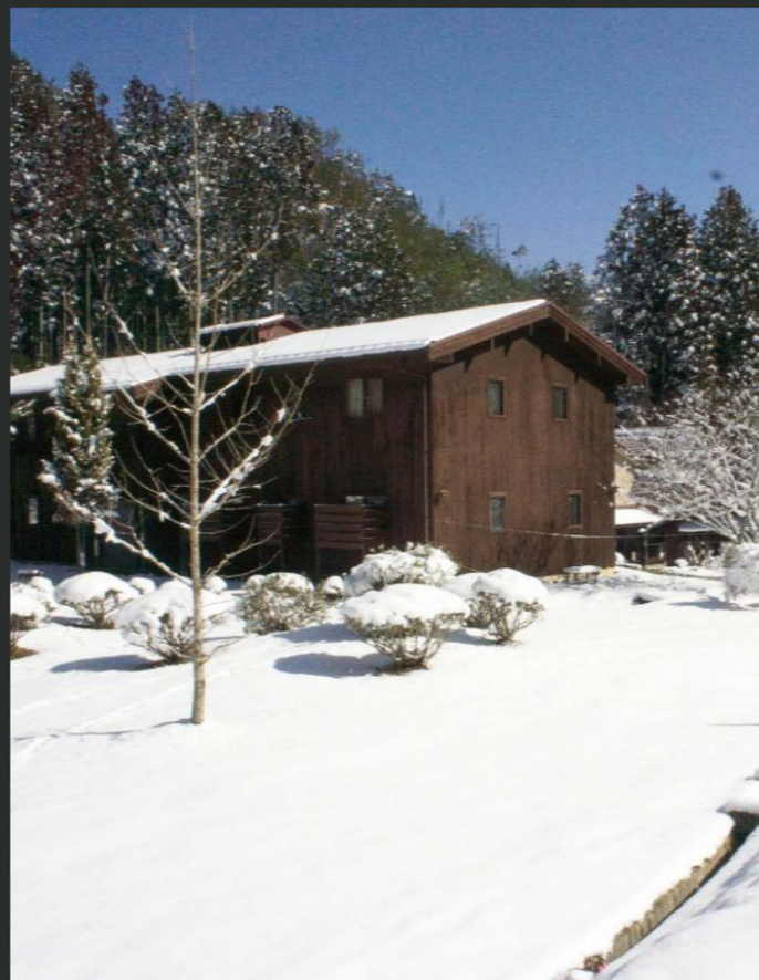
Pictured: A snowy day at Dhamma Bhanu, Japan.