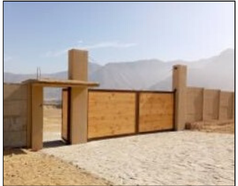
Photo: New perimeter wall at Dhamma Suriya, Peru.

Grant to Asociación Vipassana Perú for construction at Dhamma Suriya Meditation Center: On January 13th, 2022, a grant was disbursed to build a perimeter wall around the center. This will increase security and privacy at the center. The wall construction includes a large vehicle entrance gate and a secure pedestrian entrance.