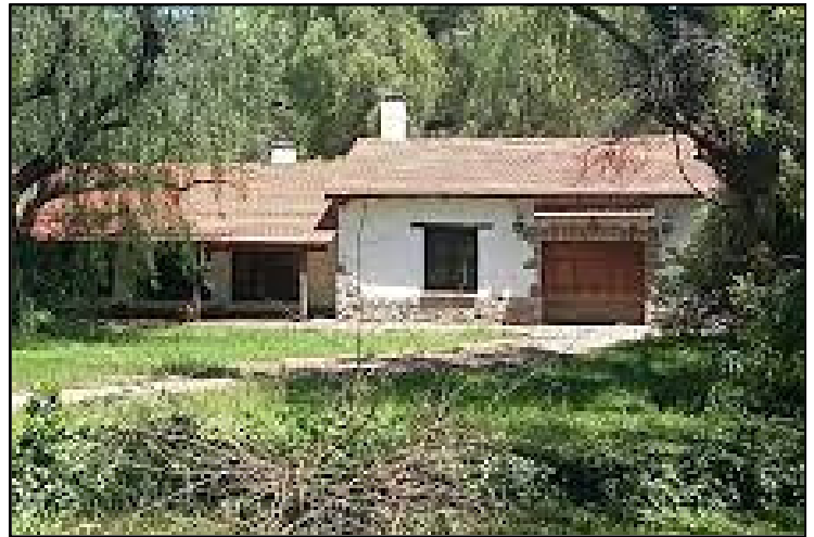
Photo: Dhamma Sukhadha Meditation, Argentina

To enhance the center's ability to operate year-round, a grant was disbursed on May 31st, 2022, and an additional grant on July 14th, 2022. Dhamma Sukhadha was previously unable to operate during winter months. The grant went toward winterizing the center by constructing additional exterior walls with thermal insulation to existing buildings. Heating and cooling systems, including underfloor heating, were installed in the meditation hall.