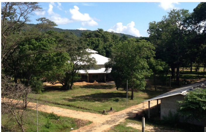
Photo: Dhamma Dharani, Sri Lanka.

To support opening meditation courses to 36 students, a grant was disbursed to the center on January 13th, 2022. The grant was awarded to replace and reinforce the roof structure of the kitchen/dining room/meditation hall complex; install and upgrade electrical and water networks; purchase equipment and furniture for the kitchen, dining rooms, and residences; add finishes to the student residences; and to purchase and install a prefabricated housing unit for Assistant Teachers.