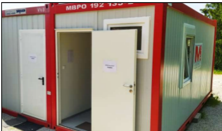
Photo: Construction containers at Dhamma Mudita, Austria.

Grant awarded to Verein für Vipassana meditation to help construct Dhamma Mudita, Austria: As part of a multi-year, multi-phase project to build the first vipassana meditation center in Austria, a project support grant was disbursed to help develop the initial buildings on the new center located near Linz, Austria on January 28th, 2023. The grant was used to finance the construction of five trailers needed to complete phase 1 of the center.